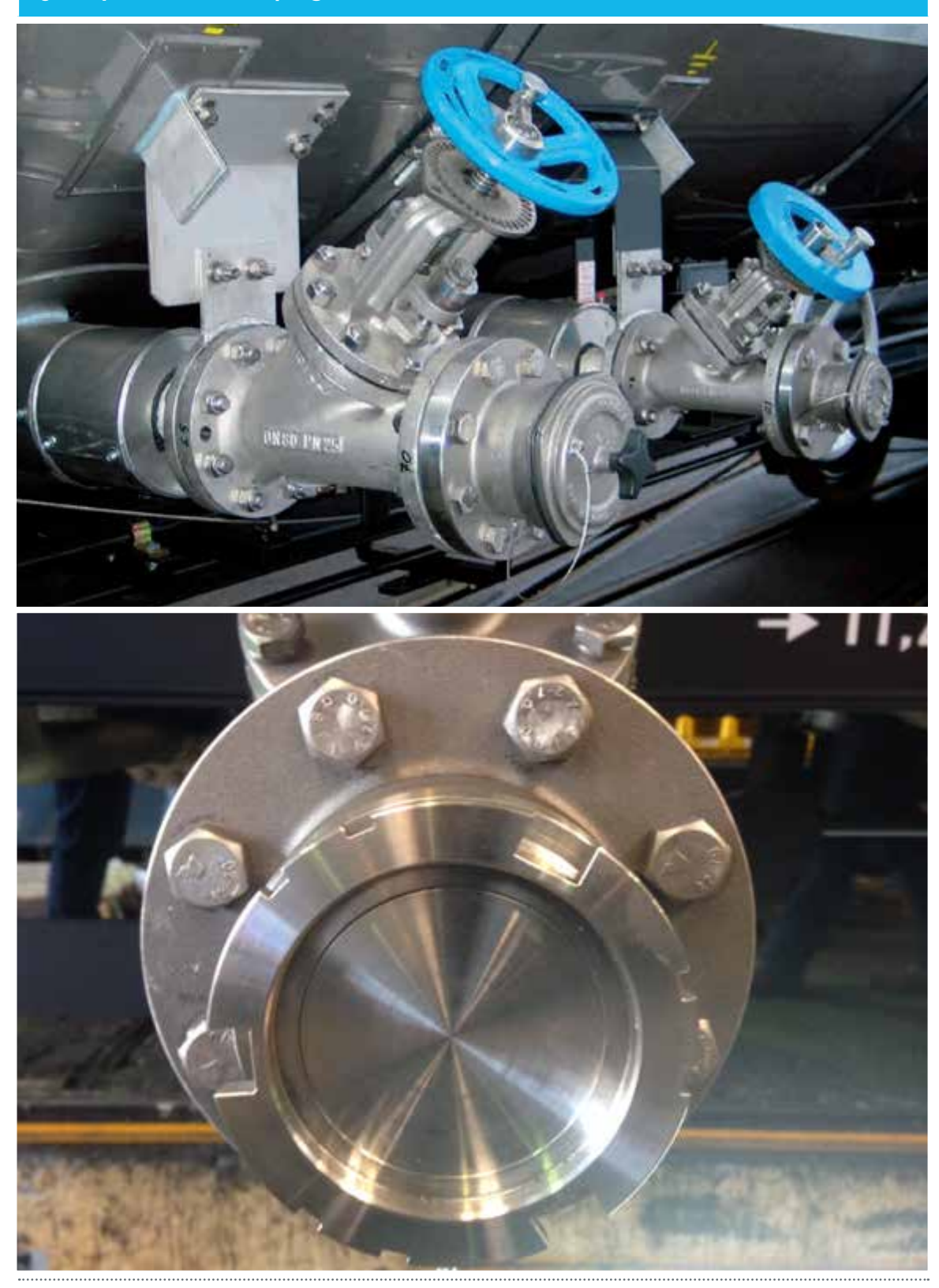
Fig. 2 Dry Disconnect Coupling connection