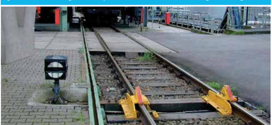
Fig. 6 Derailer at a filling station to prevent other railcars from entering the loading station

Maintenance should be done by trained personnel.