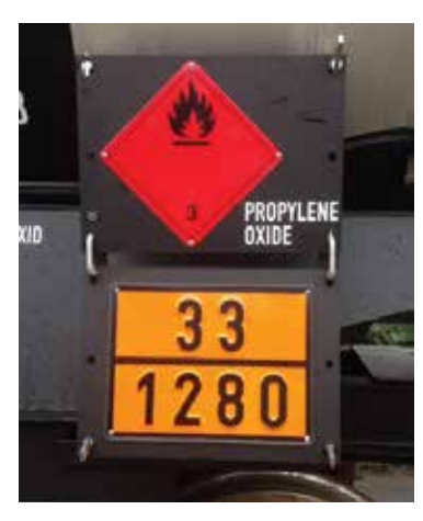
Dangerous Good label 33/1280