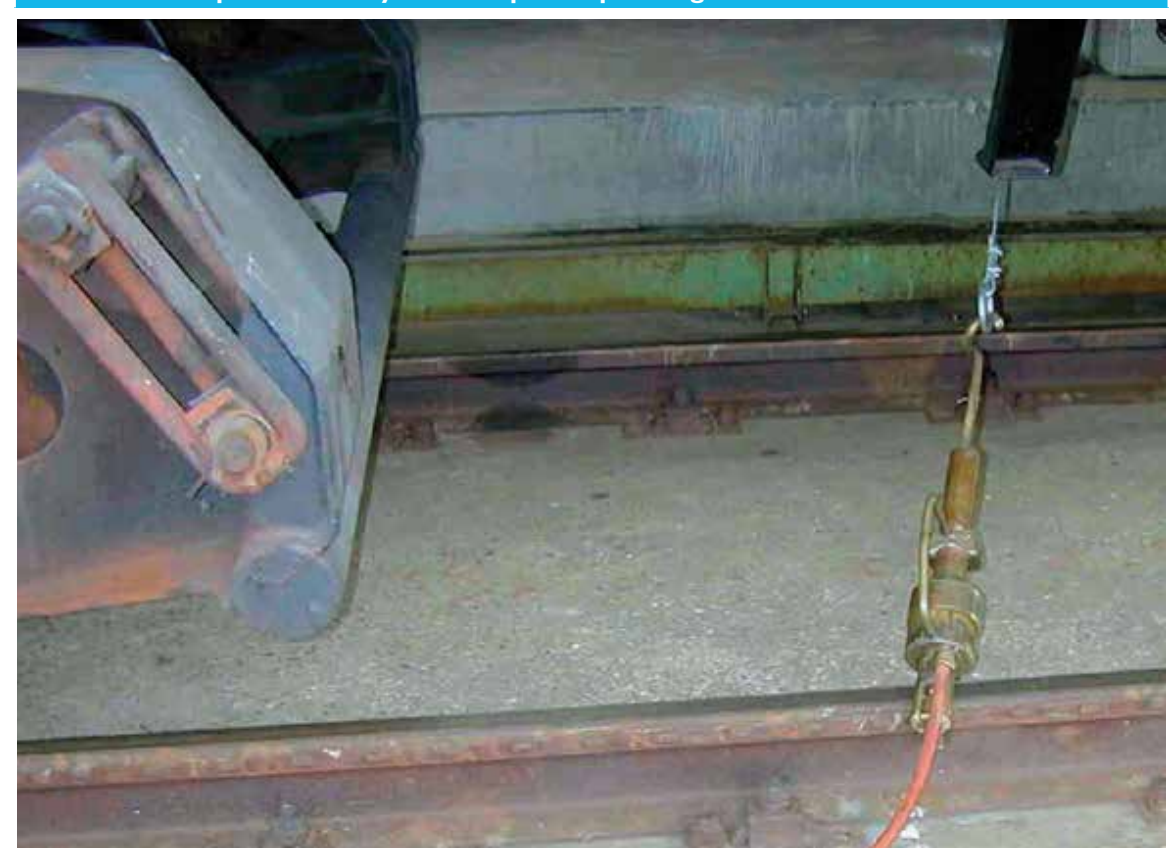
Fig. 9 Rail hook combined with a remote control, which closes the bottom valve if activated. This example shows only the set up for liquefied gas railcars.